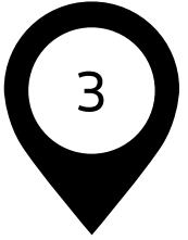
Table 3.8. STEM Road Map Module Schedule for Week Three